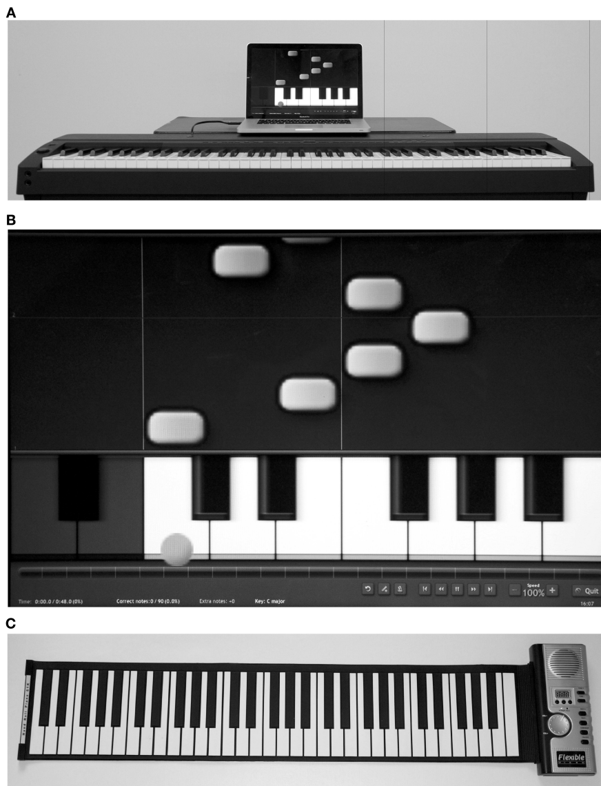
FIGURE 2 | (A) Structured training session setting; (B) screen shot of Synthesia Musical Instrument Digital Interface (MIDI) piano program; (C) Roll-up flexible piano.

between measurement time-points. Correlations were carried out between change scores on the clinical measures and characteristics of the participants at baseline [age, time since stroke, motor recovery (CMSA), and manual dexterity (BBT)]. Pearson correlation coefficients were used for all outcomes, except for the level of motor recovery for which Spearman's rank correlation coefficients were used. Statistical analyses were performed in SPSS V20. The level of significance was set to p < 0.05 . For each family of outcome measures, we controlled for family-wise error using modified Bonferroni correction.